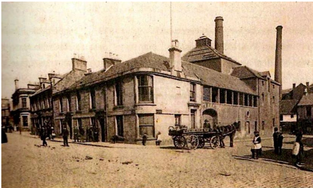
MEADOW BREWERY (1890)