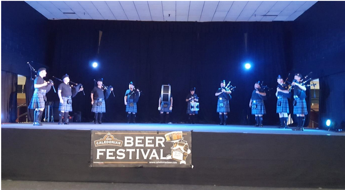
Caledonian Brewery Pipe Band (see story above).