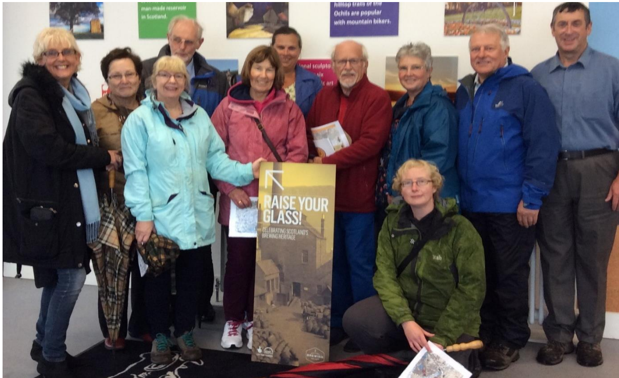
A group of the visitors at the Speirs Centre on 24 September.