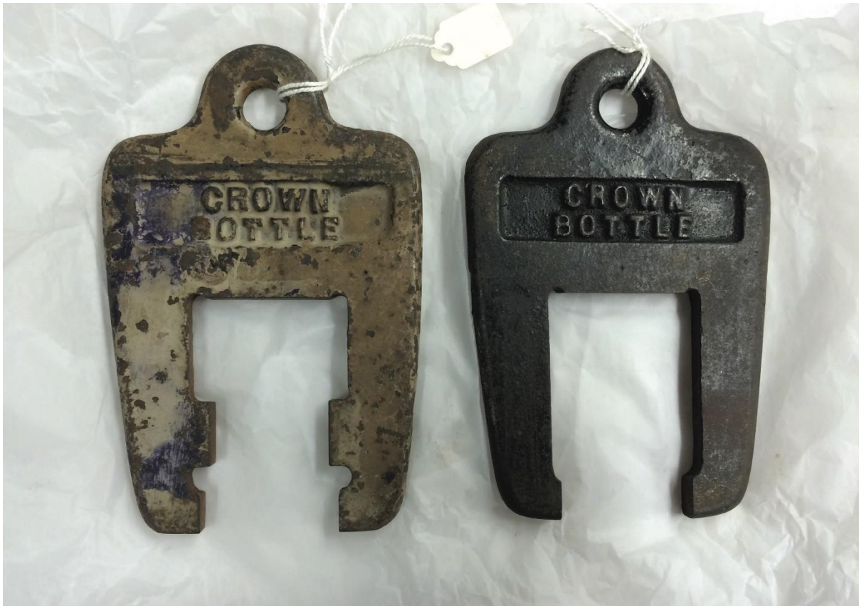
Crown bottle shoulder gauges.

“A bottle shoulder gauge was used to check that a bottle closure was depressed to the correct depth thereby ensuring that a bottle was sealed correctly, suffering no liquid leakage.”